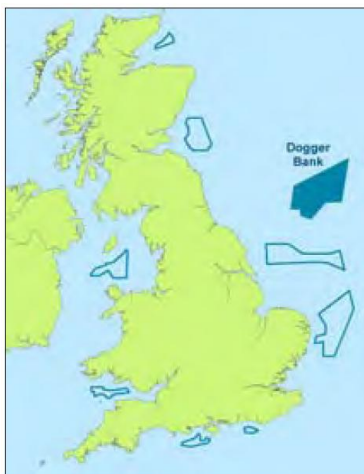
Figure 1 The Dogger Bank Zone and other Round 3 Wind Farm Zones