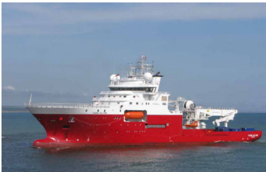
Figure 4. MV Fugro Saltire

MV Fugro Saltire (Figure 4), a 111m (LOA) purpose built dynamically positioned geotechnical vessel complete fitted with an R100 heave compensated drilling rig, will also be drilling geotechnical boreholes, through a centrally located moonpool.