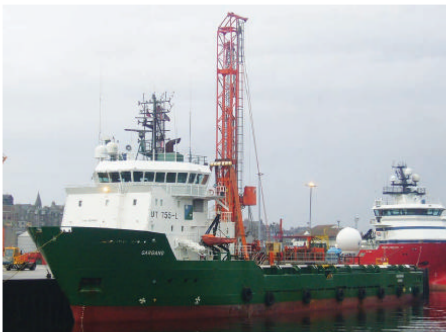
Figure 3. MV Gargano

MV Gargano (Figure 3), a 72m geotechnical drill ship fitted with an R50 heave compensated drilling rig, will be drilling geotechnical boreholes, through a centrally located moonpool.