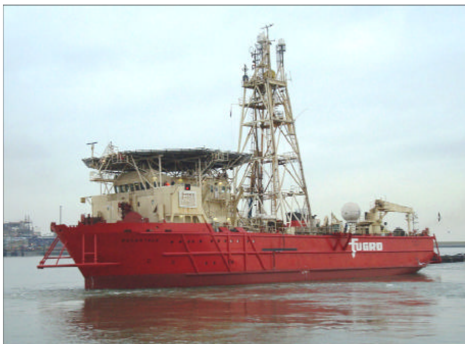
Figure 5. MV Bucentaur

MV Bucentaur (Figure 5), a 78.1m dynamically positioned drilling vessel capable of operating in up to 2000m of water, will be carrying out seabed CPT's and/or drilling geotechnical boreholes, depending on project requirements.