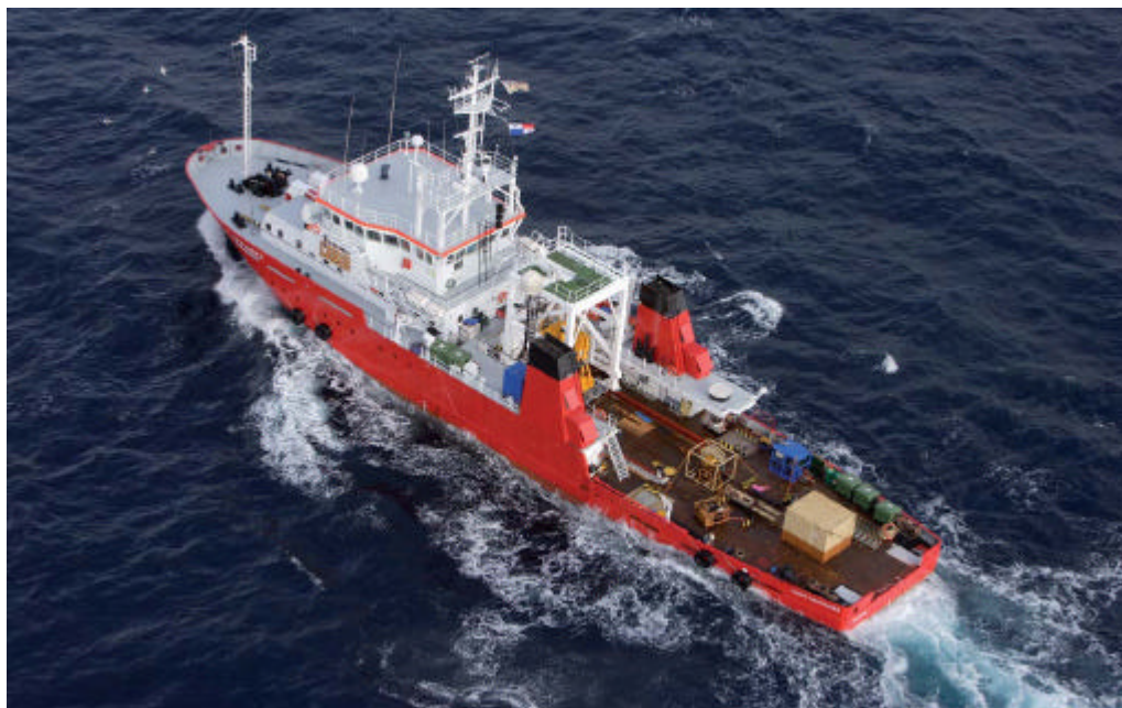
Figure 2. MV Fugro Commander

MV Fugro Commander (Figure 2), a 56m dynamically positioned geotechnical vessel, fitted with a gantry, A frame and marine crane and will be carrying out seabed CPT's through a centrally located moonpool.